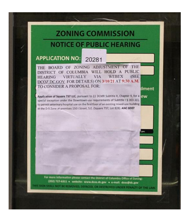
2. . 2/22/2021 2nd Street SE